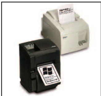
Gray or Putty