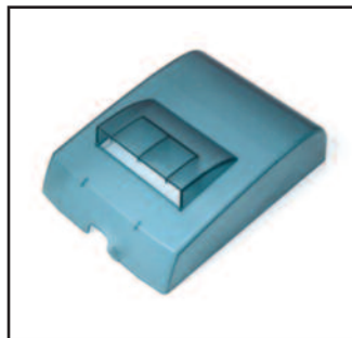
Splash Proof Cover